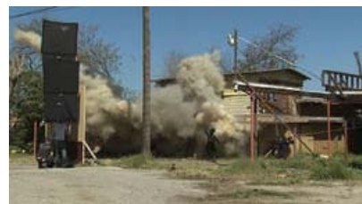
IE Home Explosions Part of Film Shoot, Warns Sheriff