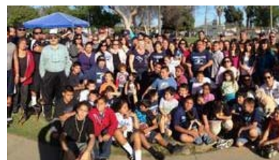
Banned Youth Football Team Defends Use of Park