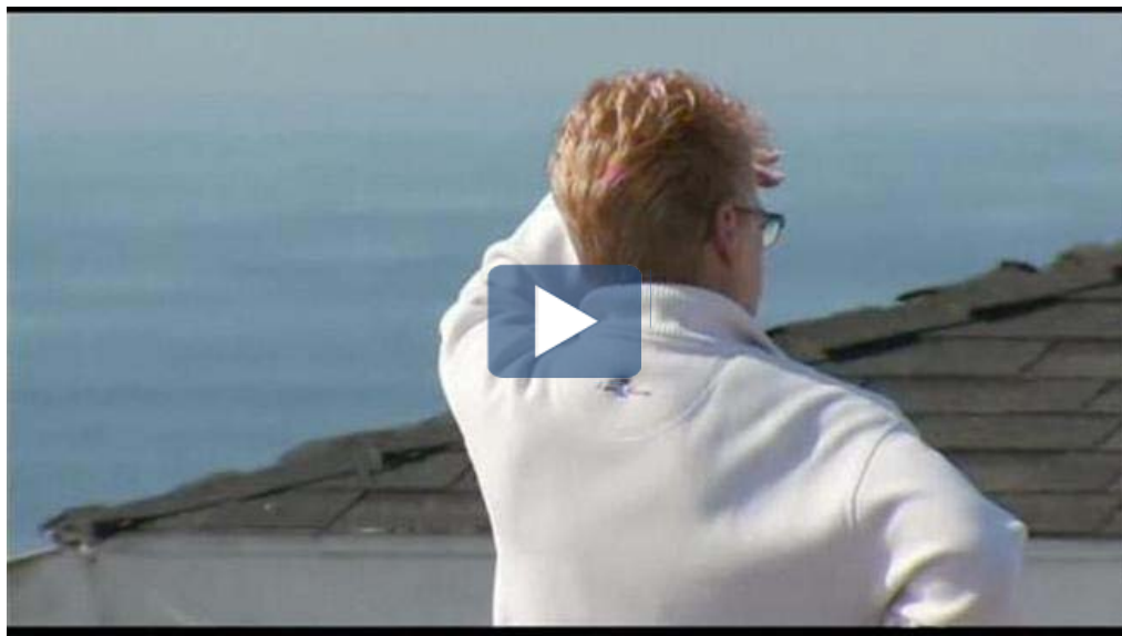
Seal Beach closed Friday morning after authorities issued a tsunami alert following the 8.9 quake in Japan.

View Comments (0) | Email | Print 0 Tweet 148 Recommend Send