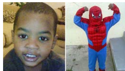
Mistrial in 5-Year-Old Boy's Halloween Slaying