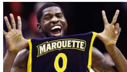
Dramatic Photos: NCAA Tournament 2013