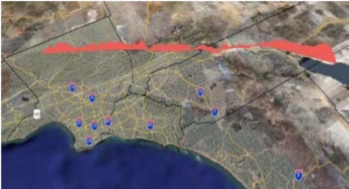
Appendix K: Figure 9-2: Earthquake Fault Map (Slip along the San Andreas Fault, as modeled is shown by the height of the red “fence” along the fault.)

The OA is prone to earthquakes from seismic faults, specifically the San Andreas Fault, and dozens of other faults throughout the OA (For a specific listing of earthquake faults maps please refer to the All-Hazards Mitigation Plan).